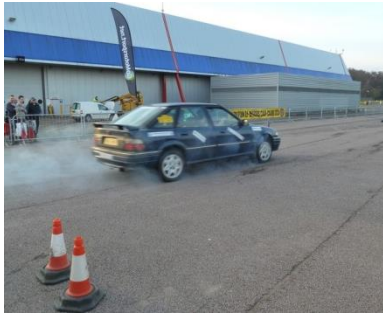
Haydn off the start line!