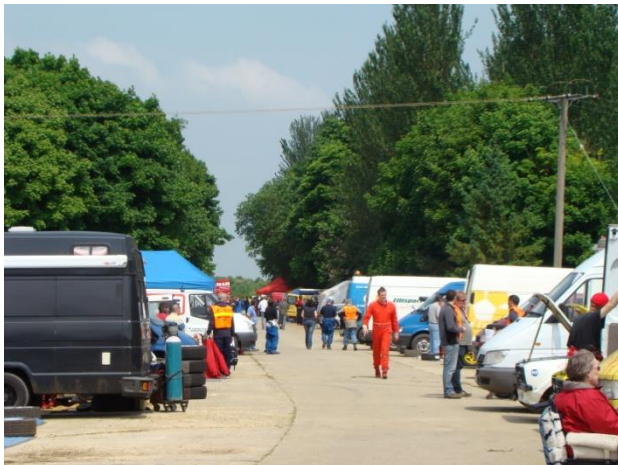
EMCOS service park - 2008